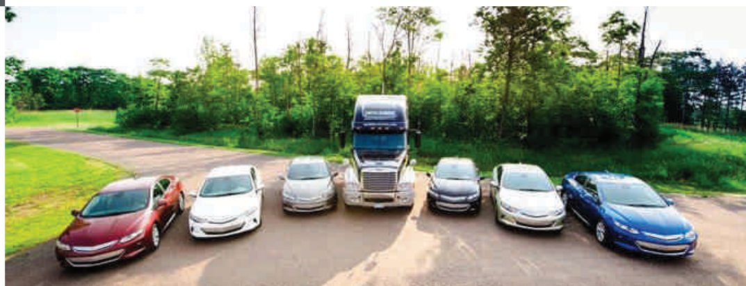
A fleet of Chevrolet Volt vehicles and a mobile laboratory have been deployed to gather data and discover