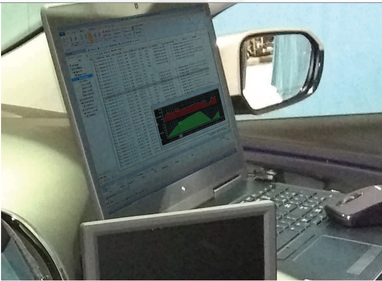
Result analysis and calibration can be performed right in the vehicle during test drives.